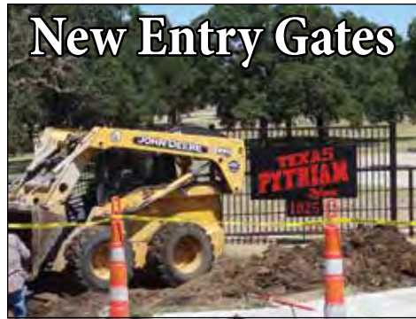
New Entry Gates