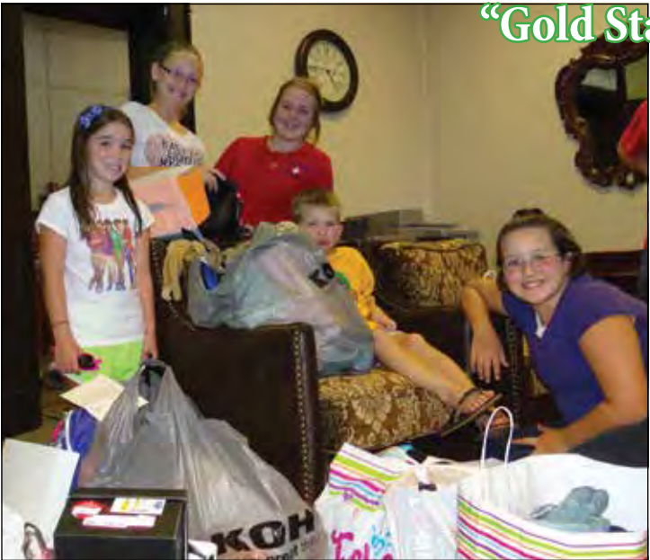
“Gold Star Kids”